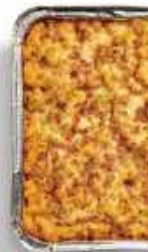
Mac & Cheese Party Tray

Visit bit.ly/YCopenstores for the store schedules and contact numbers