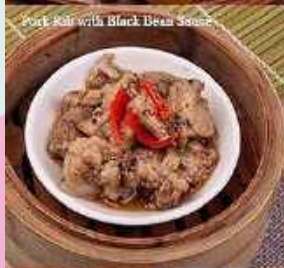
Pork Rib with Black Bean Sauce