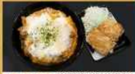
P 319 CHEESY OYAKODON SET