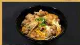
P 199 OYAKODON