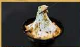
P 229 CHEESY OYAKODON