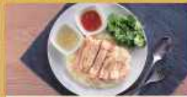
P 239 HAINANESE CHICKEN RICE