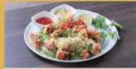
P 239 HAINANESE KARA-AGE RICE