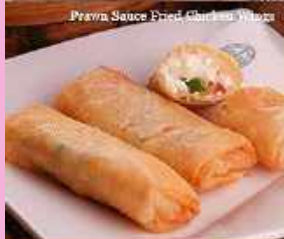
Prawn Sauce Fried Chicken Wings