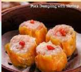
Pork Dumpling with Shrimp