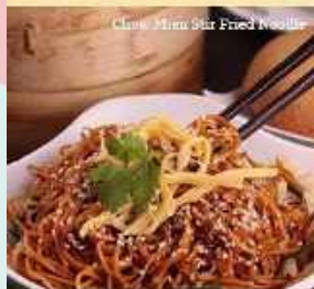
Chow Mien Stir Fried Noodle