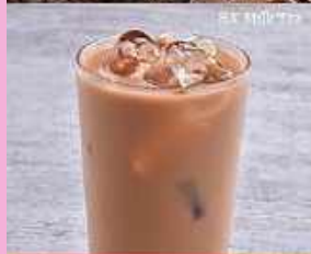
HK Milk Tea