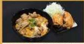
P 289 OYAKODON SET