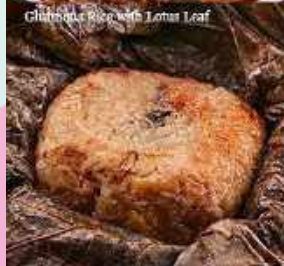
Glu Stuck Rice with Lotus Leaf