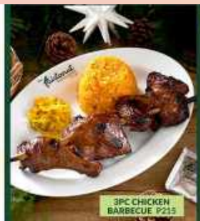
3PC CHICKEN BARBECUE P215