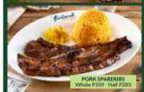
PORK SPARERIBS Whole P329 - Half P201