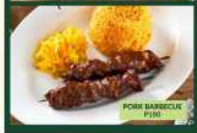
PORK BARBECUE P180