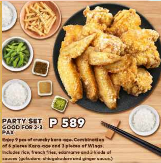
PARTY SET P 589 GOOD FOR 2-3 PAX

Enjoy 9 pcs of crunchy kara-age. Combination of 6 pieces Kara-age and 3 pieces of Wings. Includes rice, french fries, edamame and 3 kinds of sauces (gokudare, shiogokudare and ginger sauce.)