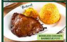
BONELESS CHICKEN BARBECUE P195