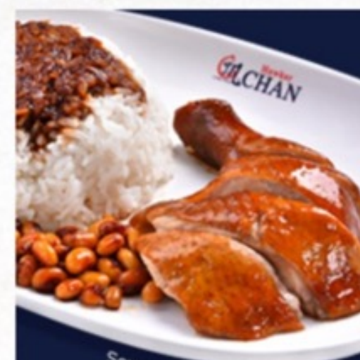
Soya Sauce Chicken Rice

Inclusive of 12% VAT. Additional 5% for packaging. 含12%的增值税. 包装另需5%.